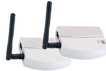
Wireless Transmitter/ Adapter